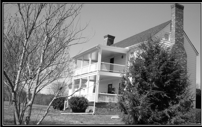
6100 Old Buckingham Road, Powhatan

Saturday July 16th - 3:00 in the Afternoon