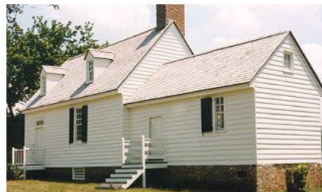
The Hillsman House - circa 2000

Thursday, November 17, 2005 at 6:30 p.m.