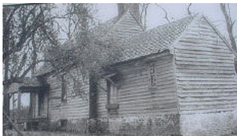
The Hillsman House - circa 1934