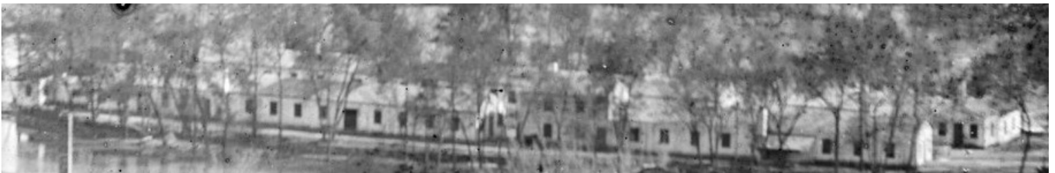
Confederate Laboratories on Brown's Island courtesy of the Library of Congress [LC-B811- 884]